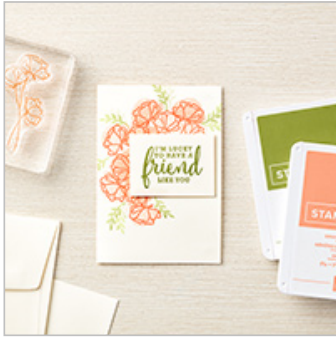
Just Getting Started Bundle