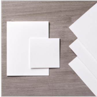
Whisper White 8-1/2\" X 11\" Thick Cardstock