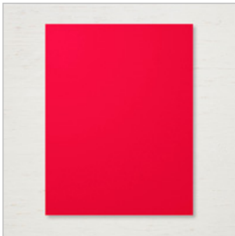
Poppy Parade 8-1/2" X 11" Cardstock