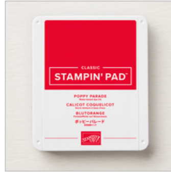
Poppy Parade Classic Stampin' Pad