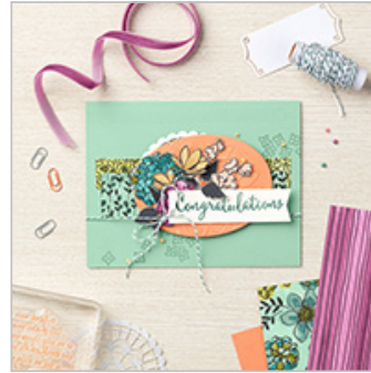
Gotta Have It All Bundle