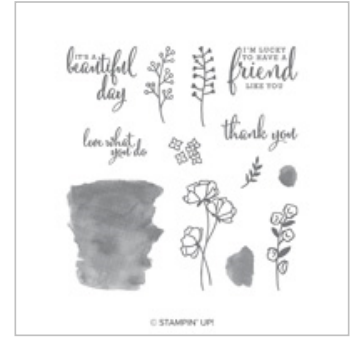
Love What You Do Photopolymer Stamp Set