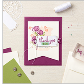
A Little More, Please Bundle