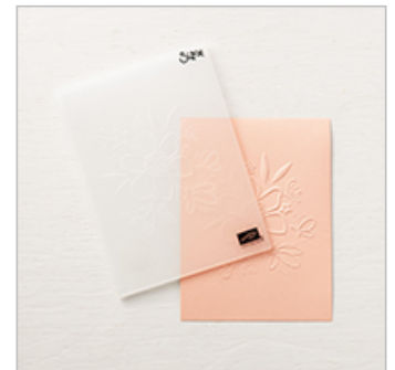
Lovely Floral Dynamic Textured Impressions Embossing Folder