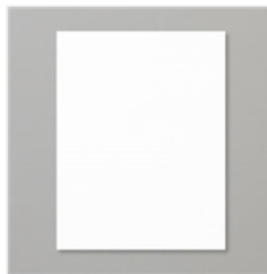
Basic White 8-1/2\"/> X 11\" Cardstock - 159276