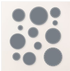
Spotlight On Nature Dies - 163580