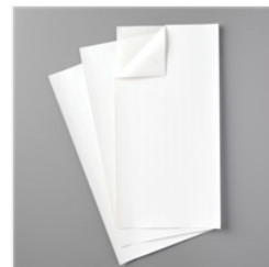
Adhesive Sheets - 152334