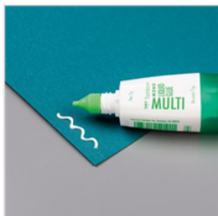
Multipurpose\" data-bbox="94 641 201 694"/>