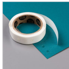
Mini Glue Dots -\" data-bbox="432 641 566 675"/>