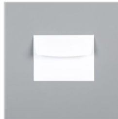
Basic White\" data-bbox="420 408 577 462"/>