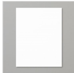
Basic White 8-1/2\" data-bbox="247 408 398 462"/>