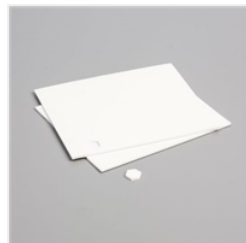
Stampin'\" data-bbox="261 641 384 694"/>