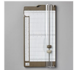
Paper Trimmer -\" data-bbox="781 408 929 443"/>