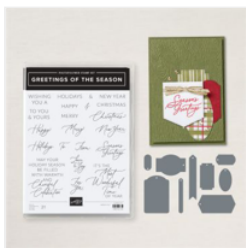
Greetings Of The Season Bundle (English) - 164113