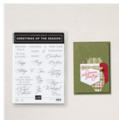
Greetings Of The Season Photopolymer Stamp Set (English) - 164325