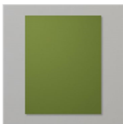
Mossy Meadow 8-1/2" X 11" Cardstock - 133676