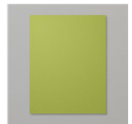
Old Olive 8-1/2" X 11" Cardstock - 100702