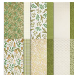
Season Of Green & Gold 12" X 12" (30.5 X 30.5 Cm) Specialty Designer Series Paper - 164324