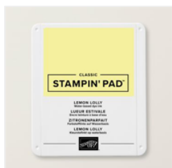
Lemon Lolly Classic Stampin' Pad - 161666