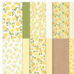
Floral Delight 12" X 12" (30.5 X 30.5 Cm) Designer Series Paper - 164700