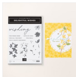
Delightful Wishes Photopolymer Stamp Set (English) - 164701