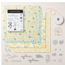
Floral Delight Suite Collection (English) - 164716