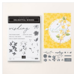
Delightful Wishes Bundle (English) - 164710