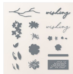
Delightful Wishes Dies (English) - 164707