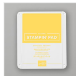
Daffodil Delight Classic Stampin' Pad - 147094