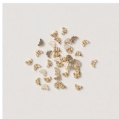
Tiny Bee Trinkets - 164714