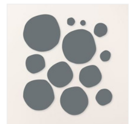
Around It All Dies - 164725