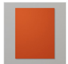
Cajun Craze 8-1/2" X 11" Cardstock - 119684