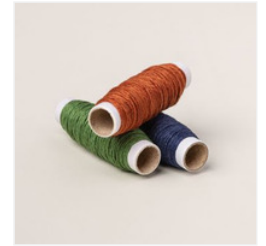
Natural Tones Linen Thread - 164071