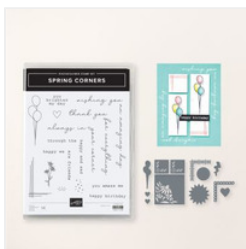
Spring Corners Bundle (English) - 164743