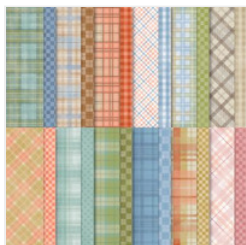
Timeless Plaid 6" X 6" (15.2 X 15.2 Cm) Designer Series Paper - 164678