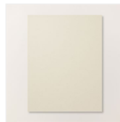
Basic Beige 8-1/2" X 11" Cardstock - 164511