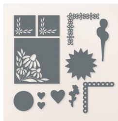
Spring Corners Dies - 164742