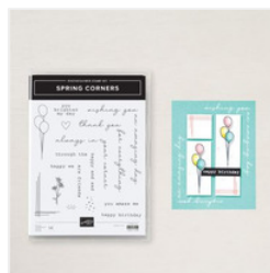
Spring Corners Photopolymer Stamp Set (English) - 164738