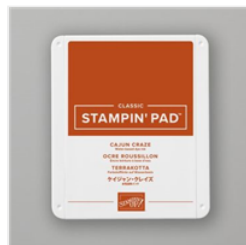
Cajun Craze Classic Stampin' Pad - 147085