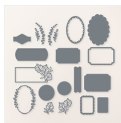
Unbounded Love Dies - 163383