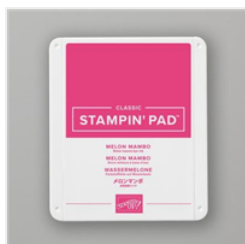
Melon Mambo Classic Stampin' Pad - 147051