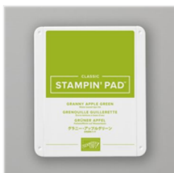
Granny Apple Green Classic Stampin' Pad - 147095