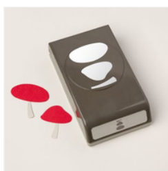
Terrific Toadstools Builder Punch - 164789