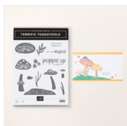
Terrific Toadstools Photopolymer Stamp Set (English) - 164783