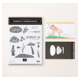
Terrific Toadstools Bundle (English) - 164790