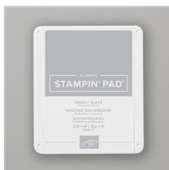
Smoky Slate Classic Stampin' Pad - 147113