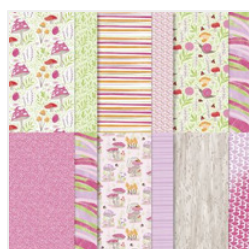
Toadstool Gardens 6" X 6" (15.2 X 15.2 Cm) Designer Series Paper - 164942