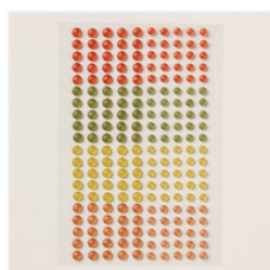
Faux Glass Dots - 164060