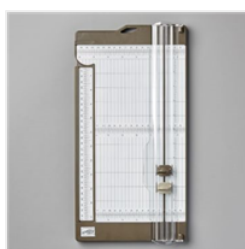
Paper Trimmer - 152392