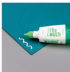
Multipurpose Liquid Glue - 110755