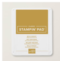
Wild Wheat Classic Stampin' Pad - 161651 Price: $9.00