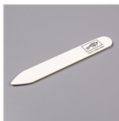
Bone Folder - 102300