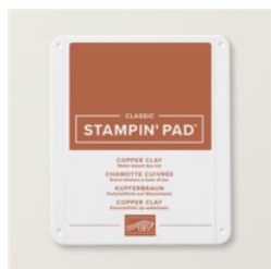
Copper Clay Classic Stampin' Pad - 161647 Price: $9.00