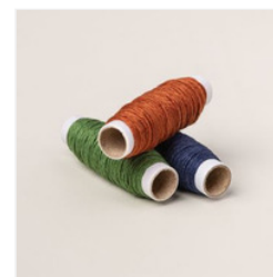
Natural Tones Linen Thread - 164071