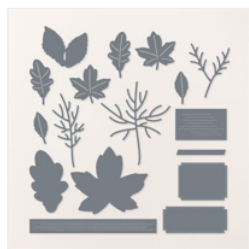
Autumn Leaves Dies - 162185