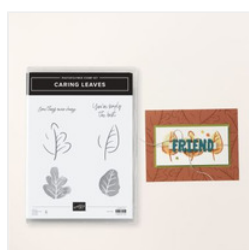
Caring Leaves Photopolymer Stamp Set (English) - 164273 Price: $17.00