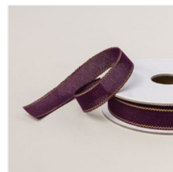
Blackberry Bliss & Gold 1/2" (1.3 Cm) Textured Ribbon - 164039