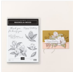
Magnolia Mood Cling Stamp Set (English) - 163502