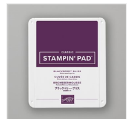
Blackberry Bliss Classic Stampin' Pad - 147092