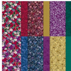
Regal Winter 12" X 12" (30.5 X 30.5 Cm) Designer Series Paper - 164156