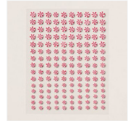
Real Red & White Adhesive-Backed Peppermints - 164050