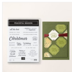
Peaceful Season Photopolymer Stamp Set (English) - 164145