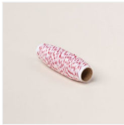
Real Red & White Baker's Twine - 164051