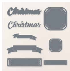
Peaceful Season Dies (English) - 164020