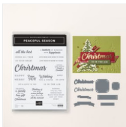
Peaceful Season Bundle (English) - 164021