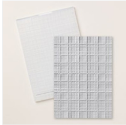
Forever Plaid 3D Embossing Folder - 164049