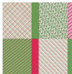
Take A Bow 6" X 6" (15.2 X 15.2 Cm) Designer Series Paper - 164309