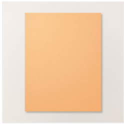
Peach Pie 8-1/2" X 11" Cardstock - 163799