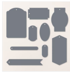
Greetings Of The Season Dies - 164112