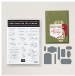
Greetings Of The Season Bundle (English) - 164113