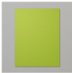
Granny Apple Green 8-1/2" X 11" Cardstock - 146990