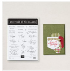
Greetings Of The Season Photopolymer Stamp Set (English) - 164325