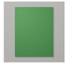
Garden Green 8-1/2" X 11" Cardstock - 102584