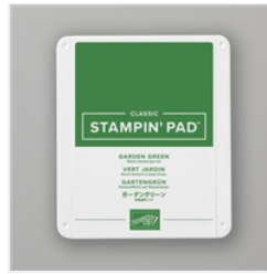
Garden Green Classic Stampin' Pad - 147089