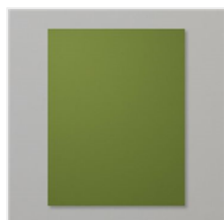
Mossy Meadow 8-1/2" X 11" Cardstock - 133676