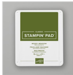
Mossy Meadow Classic Stampin' Pad - 147111