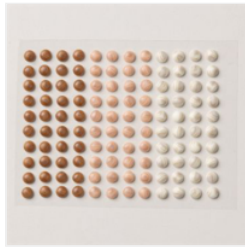
Adhesive-Backed Swirl Dots - 163464