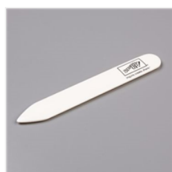
Bone Folder - 102300