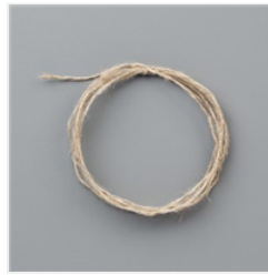
Linen Thread - 104199