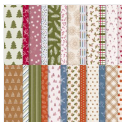
Iconic Celebrations 6" X 6" (15.2 X 15.2 Cm) Designer Series Paper - 164193