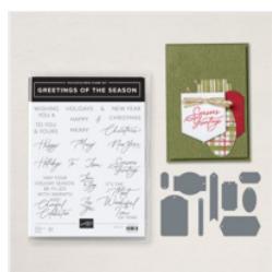
Greetings Of The Season Bundle (English) - 164113