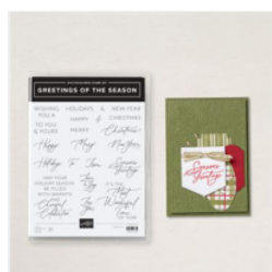
Greetings Of The Season Photopolymer Stamp Set (English) - 164325