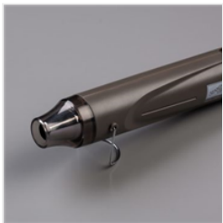
Heat Tool - 129053