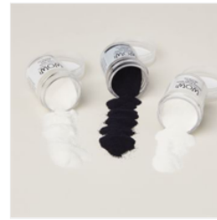
Basics Wow! Embossing Powder - 165679