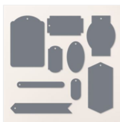
Greetings Of The Season Dies - 164112