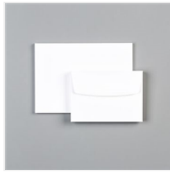
Basic White Note Cards & Envelopes - 159232