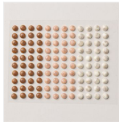
Adhesive-Backed Swirl Dots - 163464