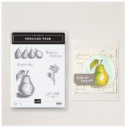
Penciled Pear Cling Stamp Set (English) - 163526