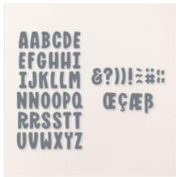
Mini Alphabet Dies - 162934

Mary Fish maryfish@stampinpretty.com http://stampinpretty.com