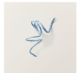
2023-2025 In Color Jute Trim - 161637