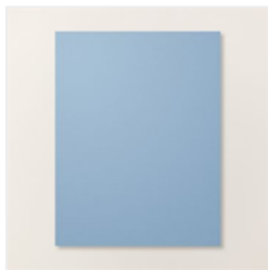
Boho Blue 8-1/2" X 11" Cardstock - 161724