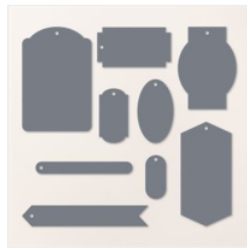
Greetings Of The Season Dies - 164112