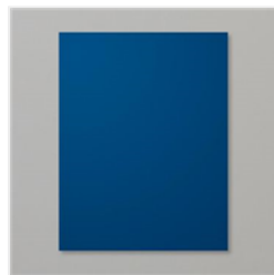
Night Of Navy 8-1/2" X 11" Cardstock - 100867