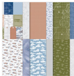
Take To The Sky 12" X 12" (30.5 X 30.5 Cm) Designer Series Paper - 163436