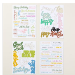
Saying Something Mix & Match Ephemera Pack (English) - 163761