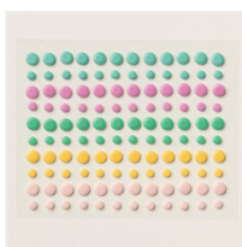
2024-2026 In Color™ Resin Dots - 163389