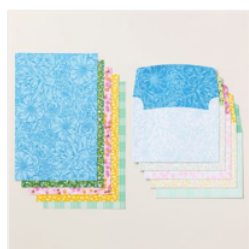
Sunny Springs Mix & Match Cards & Envelopes - 163754