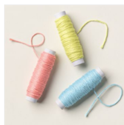
Baker's Twine Three Color Pack - 162759