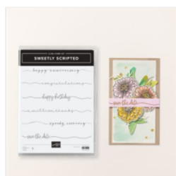
Sweetly Scripted Cling Stamp Set (English) - 163600

Mary Fish maryfish@stampinpretty.com http://stampinpretty.com