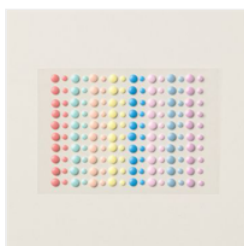
Rainbow Adhesive-Backed Dots - 162758