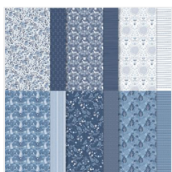
Countryside Inn 12" X 12" (30.5 X 30.5 Cm) Designer Series Paper - 161467