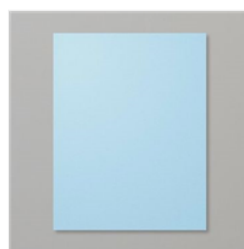
Balmy Blue 8-1/2" X 11" Cardstock - 146982