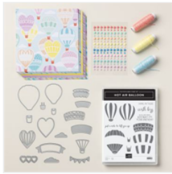
Lighter Than Air Suite Collection (English) - 162761