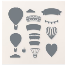
Hot Air Balloon Dies - 162754