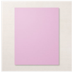
Fresh Freesia 8-1/2" X 11" Cardstock - 155613