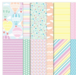
Lighter Than Air 6" X 6" (15.2 X 15.2 Cm) Designer Series Paper - 162747