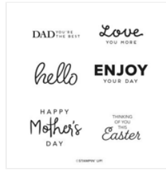
Heartfelt Hellos Cling Stamp Set (English) - 162964