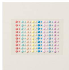
Rainbow Adhesive-Backed Dots - 162758