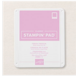
Fresh Freesia Classic Stampin' Pad - 155611