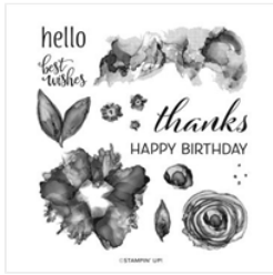
Artistically Inked Cling Stamp Set - 154542