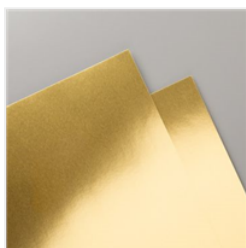
Gold Foil Sheets - 132622