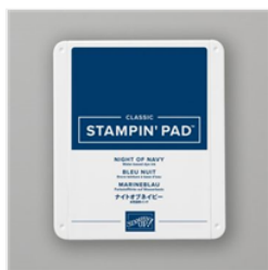
Night of Navy Classic Stampin' Pad - 147110