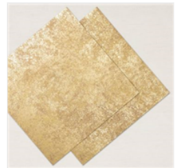
Distressed Gold 12" X 12" (30.5 X 30.5 Cm) Specialty Paper - 159237