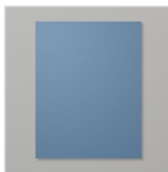
Misty Moonlight 8- 1/2" X 11" Cardstock - 153081