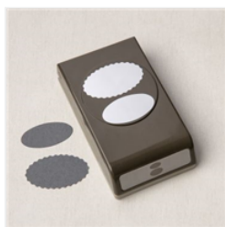
Double Oval Punch - 154242