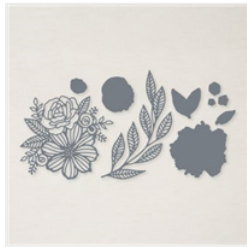
Artistic Dies - 155371