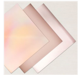
Rose Gold 12" X 12" (30.5 X 30.5 Cm) Specialty Paper - 159139