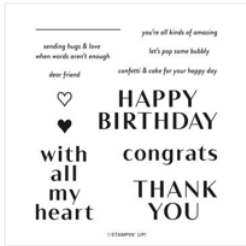
Phrases For All Photopolymer Stamp Set (English) - 161403