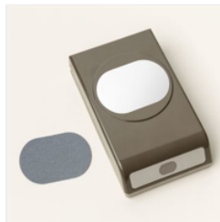
Modern Oval Punch - 162234