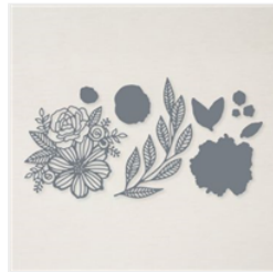
Artistic Dies - 155371