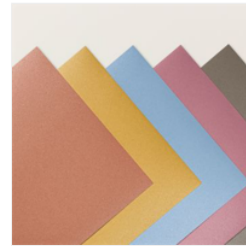
2023-2025 In Color™ 12" X 12" (30.5 X 30.5 Cm) Luster Specialty Paper - 161746