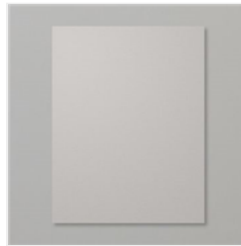
Gray Granite 8-1/2" X 11" Cardstock - 146983