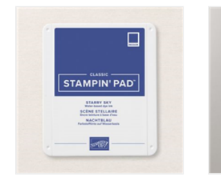
Starry Sky Classic Stampin' Pad -159212 Price: $9.00 Add to Cart

Mary Fish maryfish@stampinpretty.com http://stampinpretty.com