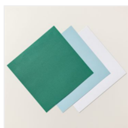
Textured 12" X 12" (30.5 X 30.5 Cm) Shimmer Paper - 160838