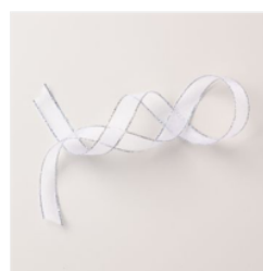
Silver & White 1/2" (1.3 Cm) Sheer Ribbon - 162149