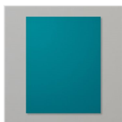
Pretty Peacock 8-1/2" X 11" Cardstock - 150880