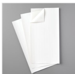
Adhesive Sheets - 152334