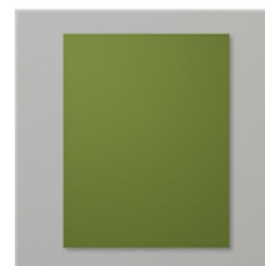
Mossy Meadow 8- 1/2" X 11" Cardstock - 133676