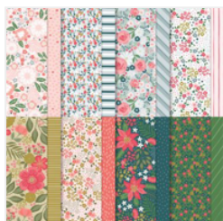
Garden Walk 6" X 6" (15.2 X 15.2 Cm) Designer Series Paper - 162227