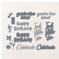
Wanted To Say Dies - 161594