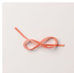
Calypso Coral 3/16" (4.8 Mm) Braided Linen Trim - 162239