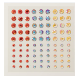
Iridescent Pastel Gems - 160429