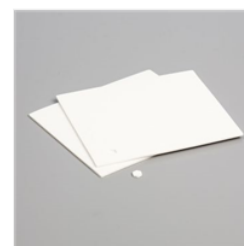
Mini Stampin' Dimensionals - 144108