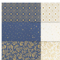
Shining Brightly 12" X 12" (30.5 X 30.5 Cm) Specialty Designer Series Paper - 162378