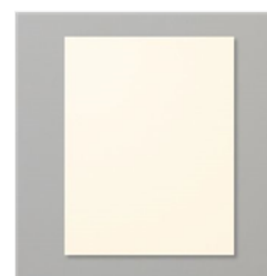
Very Vanilla 8-1/2" X 11" Cardstock - 101650