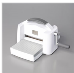
Stampin' Cut & Emboss Machine - 149653