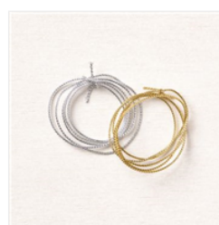
Simply Elegant Trim - 155766