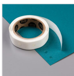
Mini Glue Dots - 103683