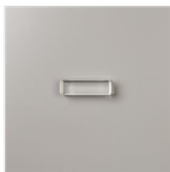
Clear Block G - 118489

Mary Fish maryfish@stampinpretty.com http://stampinpretty.com