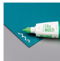
Multipurpose Liquid Glue - 110755