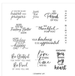
So Sincere Cling Stamp Set (English) - 162283

Mary Fish maryfish@stampinpretty.com http://stampinpretty.com