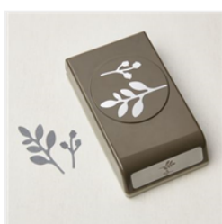
Bough Punch - 157711