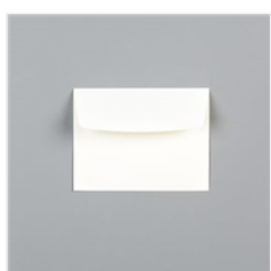
Very Vanilla Medium Envelopes - 107300