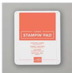
Calypso Coral Classic Stampin' Pad - 147101