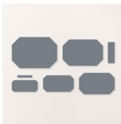
Countryside Corners Dies - 161471