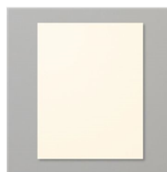
Very Vanilla 8-1/2" X 11" Thick Cardstock - 144237