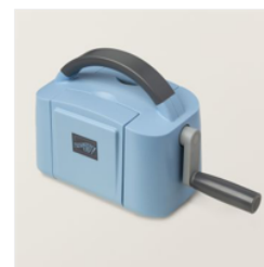
Boho Blue Limited Edition Mini Stampin' Cut & Emboss Machine - 161104