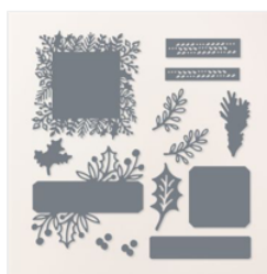
Christmas Classics Dies - 161976