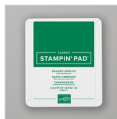
Shaded Spruce Classic Stampin' Pad - 147088