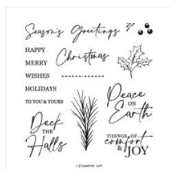
Christmas Classics Photopolymer Stamp Set (English) - 161970