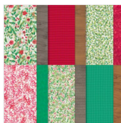
Joy Of Christmas 12" X 12" (30.5 X 30.5 Cm) Designer Series Paper - 161958