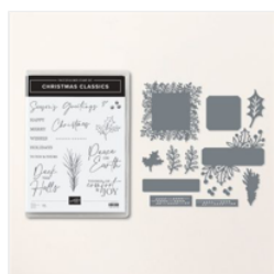
Christmas Classics Bundle (English) - 161977