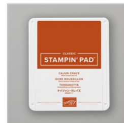
Cajun Craze Classic Stampin' Pad - 147085