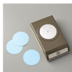
2" (5.1 Cm) Circle Punch - 133782