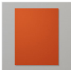
Cajun Craze 8-1/2" X 11" Cardstock - 119684