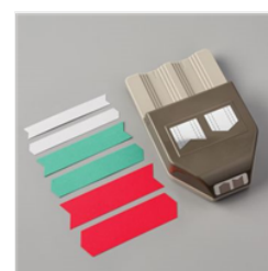
Banners Pick A Punch - 153608