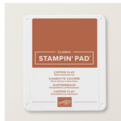
Copper Clay Classic Stampin' Pad - 161647