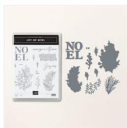
Joy Of Noel Bundle (English) - 161967