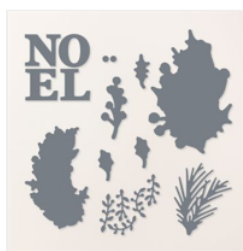
Joy Of Noel Dies - 161965