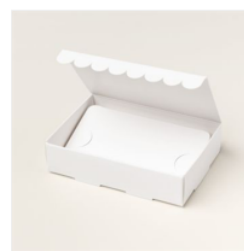
Scalloped Gift Card Boxes - 161751