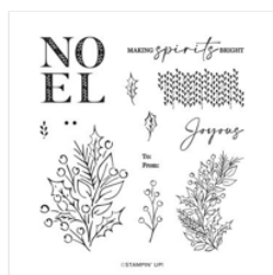
Joy Of Noel Photopolymer Stamp Set (English) - 161959