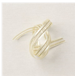
Gold & Vanilla 3/8" (1 Cm) Satin Edged Ribbon - 159555