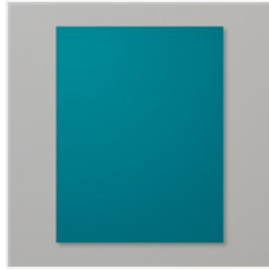
Pretty Peacock 8-1/2" X 11" Cardstock - 150880