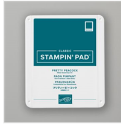
Pretty Peacock Classic Stampin' Pad - 150083