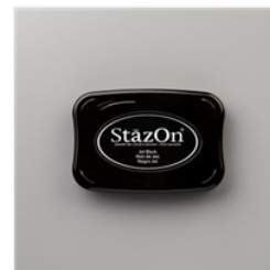
Jet Black Stazon Pad - 101406