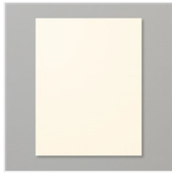
Very Vanilla 8-1/2" X 11" Thick Cardstock - 144237