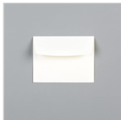
Very Vanilla Medium Envelopes - 107300