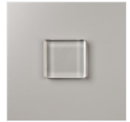
Clear Block D - 118485