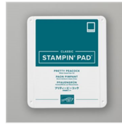
Pretty Peacock Classic Stampin' Pad - 150083