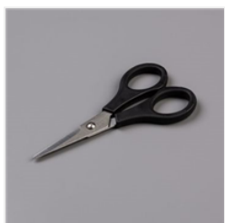
Paper Snips Scissors - 103579