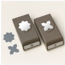
Inked & Tiled Punch Pack - 161167