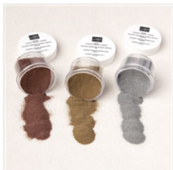
Metallics Embossing Powders - 155555