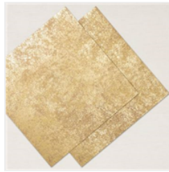
Distressed Gold 12" X 12" (30.5 X 30.5 Cm) Specialty Paper - 159237