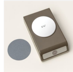
2-3/8" (6 Cm) Circle Punch - 161354