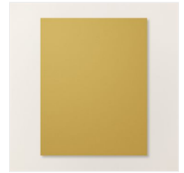
Wild Wheat 8-1/2" X 11" Cardstock - 161725