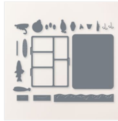
Gone Fishing Dies - 161541