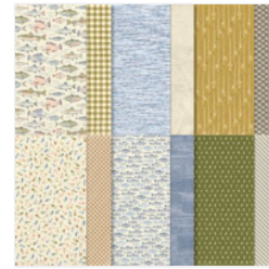
Let's Go Fishing 12" X 12" (30.5 X 30.5 Cm) Designer Series Paper - 161534