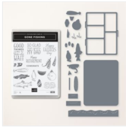
Gone Fishing Bundle (English) - 161542