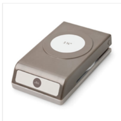
1-3/4" (4.4 Cm) Circle Punch - 119850