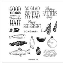
Gone Fishing Photopolymer Stamp Set (English) - 161535