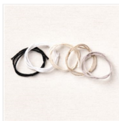
Baker's Twine Essentials Pack - 155475