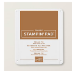
Pecan Pie Classic Stampin' Pad - 161665