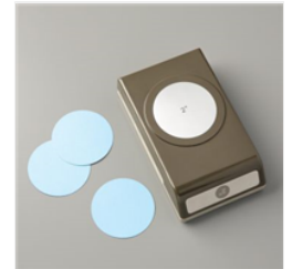
2" (5.1 Cm) Circle Punch - 133782