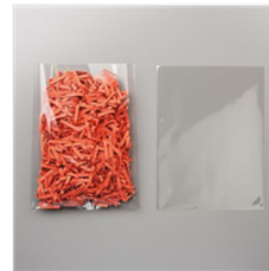
6" X 8" (15.2 X 20.3 Cm) Cellophane Bags - 102210