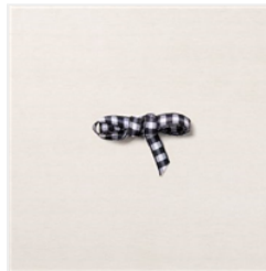
Black & White 1/4" (6.4 Mm) Gingham Ribbon - 156485