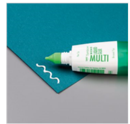
Multipurpose Liquid Glue - 110755