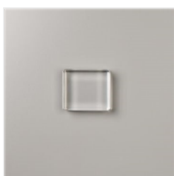
Clear Block C - 118486