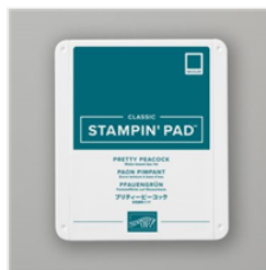
Pretty Peacock Classic Stampin' Pad - 150083