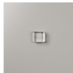
Clear Block A - 118487