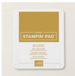
Wild Wheat Classic Stampin' Pad - 161651