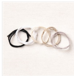
Baker's Twine Essentials Pack - 155475