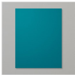
Pretty Peacock 8-1/2" X 11" Cardstock - 150880

Mary Fish maryfish@stampinpretty.com http://stampinpretty.com