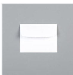
Basic White Medium Envelopes - 159236