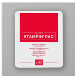
Poppy Parade Classic Stampin' Pad - 147050