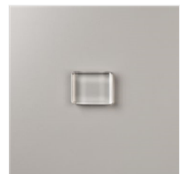
Clear Block B - 117147