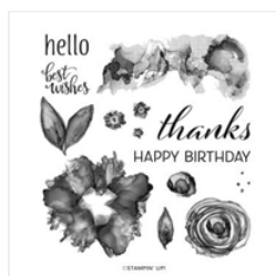
Artistically Inked Cling Stamp Set - 154542