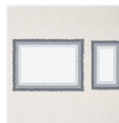
Deckled Rectangles Dies - 159173