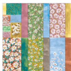
Fresh As A Daisy 12" X 12" (30.5 X 30.5 Cm) Designer Series Paper - 161289