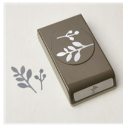
Bough Punch - 157711