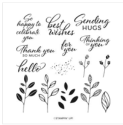
Layering Leaves Photopolymer Stamp Set (English) - 161277

Mary Fish maryfish@stampinpretty.com http://stampinpretty.com