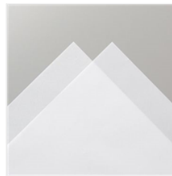
Vellum 8-1/2" X 11" Cardstock - 101856