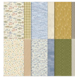
Let's Go Fishing 12" X 12" (30.5 X 30.5 Cm) Designer Series Paper - 161534