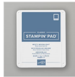
Misty Moonlight Classic Stampin' Pad - 153118