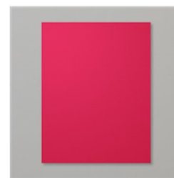
Real Red 8-1/2" X 11" Cardstock - 102482