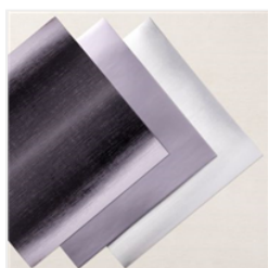
Silver Foil 12" X 12" (30.5 X 30.5 Cm) Specialty Pack - 156457