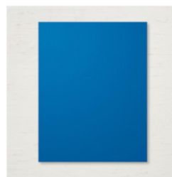
Blueberry Bushel 8-1/2" X 11" Cardstock - 146968