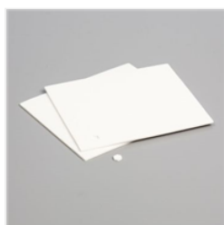
Mini Stampin' Dimensionals - 144108