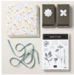
Inked Botanicals Suite Collection (English) - 161172

Mary Fish maryfish@stampinpretty.com http://stampinpretty.com