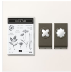
Inked & Tiled Bundle (English) - 161168