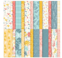
Inked Botanicals 6" X 6" (15.2 X 15.2 Cm) Designer Series Paper - 161157