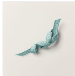
Lost Lagoon 1/4" (6.4 Mm) Bordered Ribbon - 161171