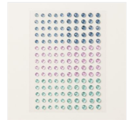
Tinsel Gems Three-Pack - 161624