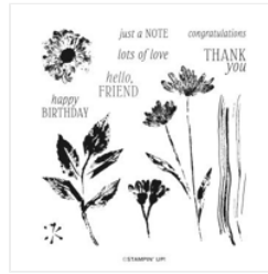
Inked & Tiled Cling Stamp Set (English) - 161158