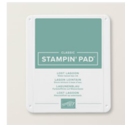
Lost Lagoon Classic Stampin' Pad - 161678