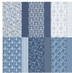
Countryside Inn 12" X 12" (30.5 X 30.5 Cm) Designer Series Paper - 161467