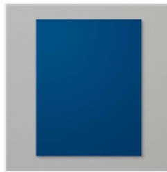
Night Of Navy 8- 1/2" X 11" Cardstock - 100867