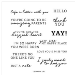
Happy Labels Photopolymer Stamp Set (English) - 160856

Mary Fish maryfish@stampinpretty.com http://stampinpretty.com