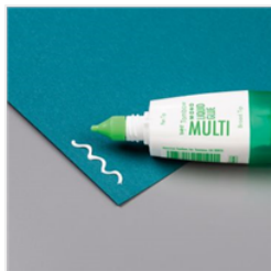
Multipurpose Liquid Glue - 110755