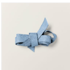
Boho Blue 3/8" (1 Cm) Textured Ribbon - 161631