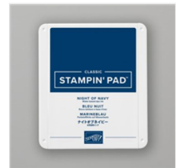
Night Of Navy Classic Stampin' Pad - 147110