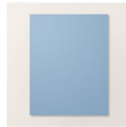
Boho Blue 8-1/2" X 11" Cardstock - 161724