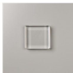
Clear Block D - 118485