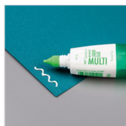
Multipurpose Liquid Glue - 110755