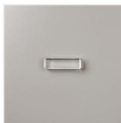
Clear Block G - 118489