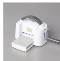
Mini Stampin' Cut & Emboss Machine - 150673