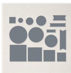
Stylish Shapes Dies - 159183