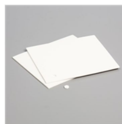
Mini Stampin' Dimensionals - 144108