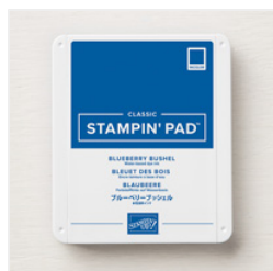
Blueberry Bushel Classic Stampin' Pad - 147138