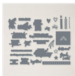
Sentiment Silhouettes Dies - 158733