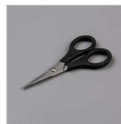
Paper Snips Scissors - 103579