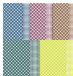
Glorious Gingham 6" X 6" (15.2 X 15.2 Cm) Designer Series Paper - 163170