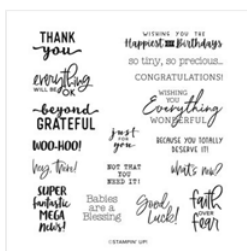
Charming Sentiments Photopolymer Stamp Set (English) - 159985