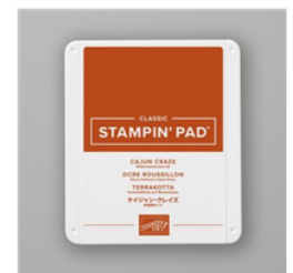
Cajun Craze Classic Stampin' Pad - 147085