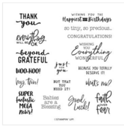
Charming Sentiments Photopolymer Stamp Set (English) - 159985