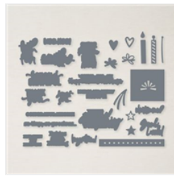
Sentiment Silhouettes Dies - 158733