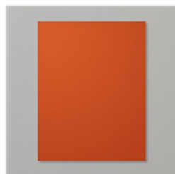
Cajun Craze 8-1/2" X 11" Cardstock - 119684