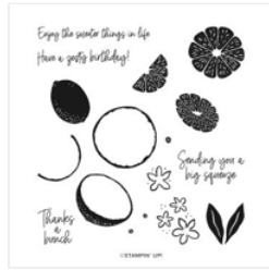
Sweet Citrus Photopolymer Stamp Set (English) - 160641