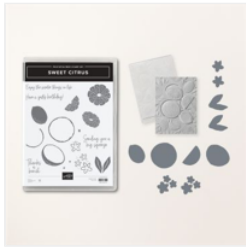
Sweet Citrus Bundle (English) - 160645