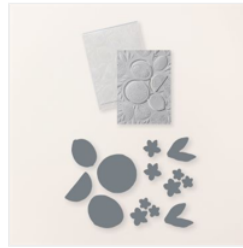
Sweet Citrus Hybrid Embossing Folder - 160644