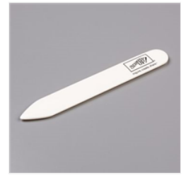
Bone Folder - 102300