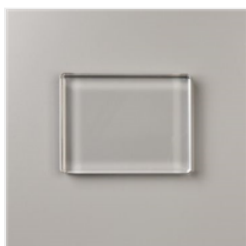
Clear Block E - 118484