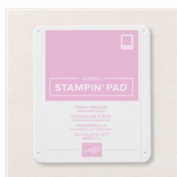
Fresh Freesia Classic Stampin' Pad - 155611