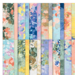
Fancy Flora 6" X 6" (15.2 X 15.2 Cm) Designer Series Paper - 160413