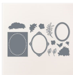
Framed Florets Dies - 160623