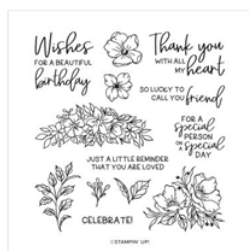
Framed Florets Photopolymer Stamp Set (English) - 161815