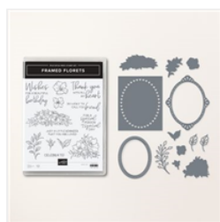
Framed Florets Bundle (English) - 162407