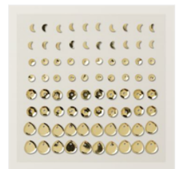
Gold Faceted Adhesive-Backed Sequins - 160536