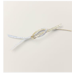
Gold & Silver 1/8" (3.2 Mm) Trim Combo Pack - 161633