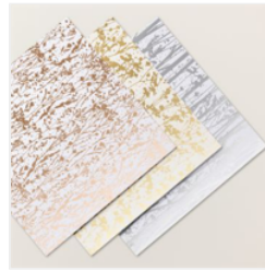
Naturally Gilded 12" X 12" (30.5 X 30.5 Cm) Specialty Designer Series Paper - 161639