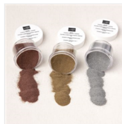
Metallics Embossing Powders - 155555