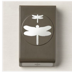
Dragonflies Punch - 154240