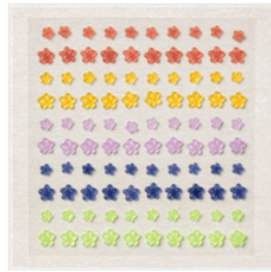
Fun Flowers Resin Shapes - 159123