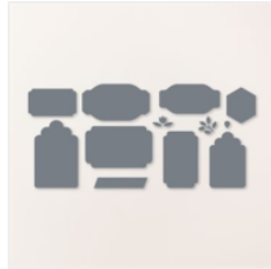
Something Fancy Dies - 160424