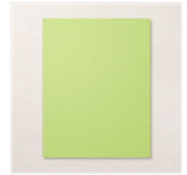
Parakeet Party 8- 1/2" X 11" Cardstock - 159259