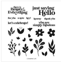
Simply Fabulous Photopolymer Stamp Set (English) - 159133

Mary Fish maryfish@stampinpretty.com http://stampinpretty.com