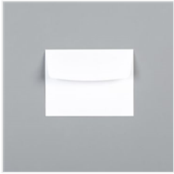
Basic White Medium Envelopes - 159236

Mary Fish maryfish@stampinpretty.com http://stampinpretty.com