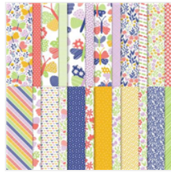
Butterfly Kisses 6" X 6" (15.2 X 15.2 Cm) Designer Series Paper - 159112