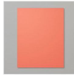
Calypso Coral 8- 1/2" X 11" Cardstock - 122925