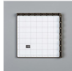
Stamparatus - 146276