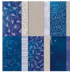
Sun Prints 12" X 12" (30.5 X 30.5 Cm) Designer Series Paper - 158790