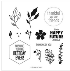
Framed Occasions Photopolymer Stamp Set (English) - 158745