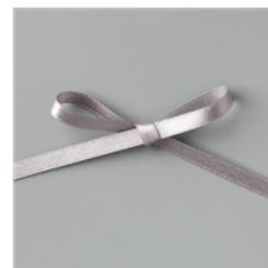
Gray Granite 1/4" (6.4 Mm) Shimmer Ribbon - 152463