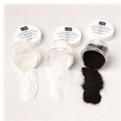
Basics Embossing Powders - 155554