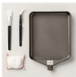
Embossing Additions Tool Kit - 159971