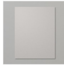
Gray Granite 8- 1/2" X 11" Cardstock - 146983