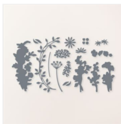
Dainty Delight Dies - 160674