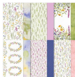
Dainty Flowers 12" X 12" (30.5 X 30.5 Cm) Designer Series Paper - 160834