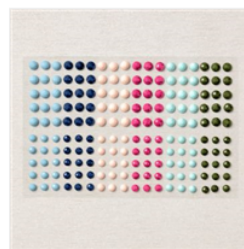
Solid Faceted Gems - 159189