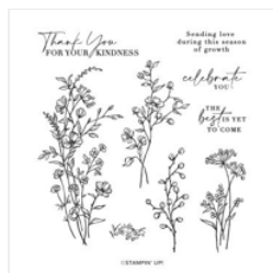
Dainty Delight Cling Stamp Set (English) - 161078