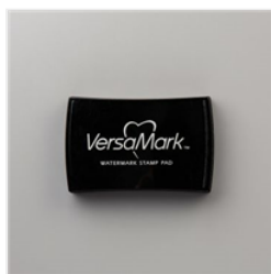
Versamark Pad - 102283