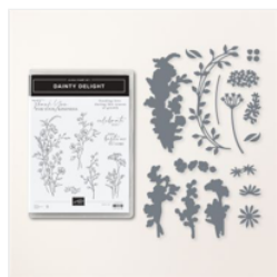
Dainty Delight Bundle (English) - 160675