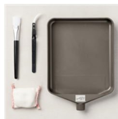
Embossing Additions Tool Kit - 159971