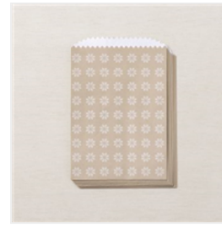
North Pole Sacks - 162416