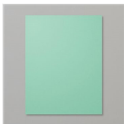
Coastal Cabana 8- 1/2" X 11" Cardstock - 131297