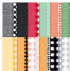
Gingham Cottage 12" X 12" (30,5 X 30,5 Cm) Designer Series Paper - 159651