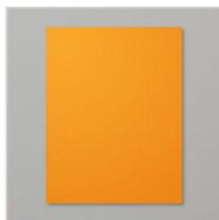
Pumpkin Pie 8-1/2" X 11" Cardstock - 105117