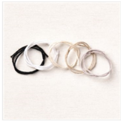
Baker's Twine Essentials Pack - 155475