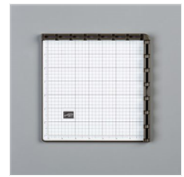
Stamaparatus - 146276