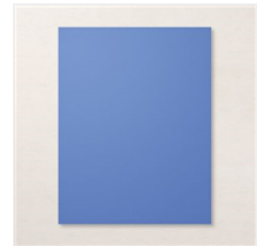
Orchid Oasis 8- 1/2" X 11" Cardstock - 159267