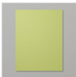
Pear Pizzazz 8- 1/2" X 11" Cardstock - 131201