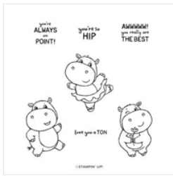
Hippest Hippos Cling Stamp Set (English) - 159921

Mary Fish stampinpretty@gmail.com http://stampinpretty.com