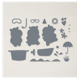
Hippo Dies - 159928