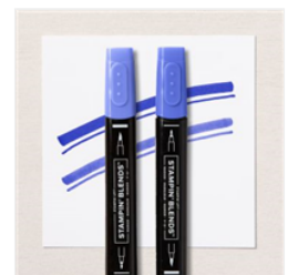
Orchid Oasis Stampin' Blends Combo Pack - 159223