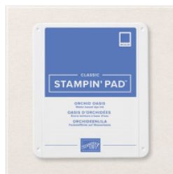
Orchid Oasis Classic Stampin' Pad - 159214